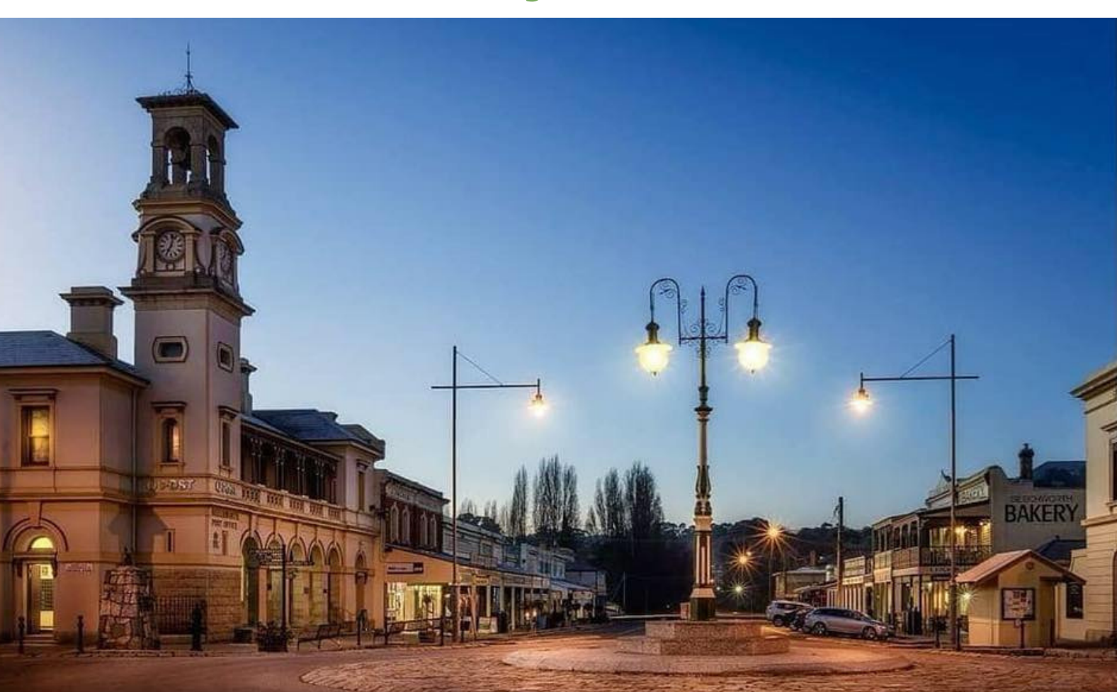
Pictured: Beechworth, Victorian Tidy Town Winner 2023